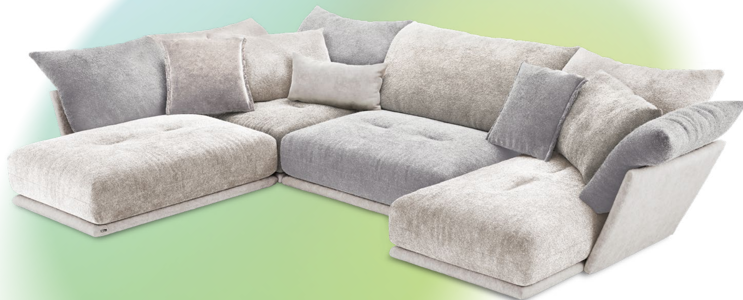
Mli-S-U-Xre 102 Esfera (Set 4) BxTxH 280 x 156 x 81 cm Fabric : moonlight / grigio / lino / nuvola

Like almost all our characters, this sofa system is based on the concept of versatility. The basic modules can be used to create sofas, U-shapes and and corner solutions - depending on own preferences. For those who value individuality, the seat and back cushions as well as the body itself can be covered with various fabrics and patterns from our collection, like a three-dimensional collage.