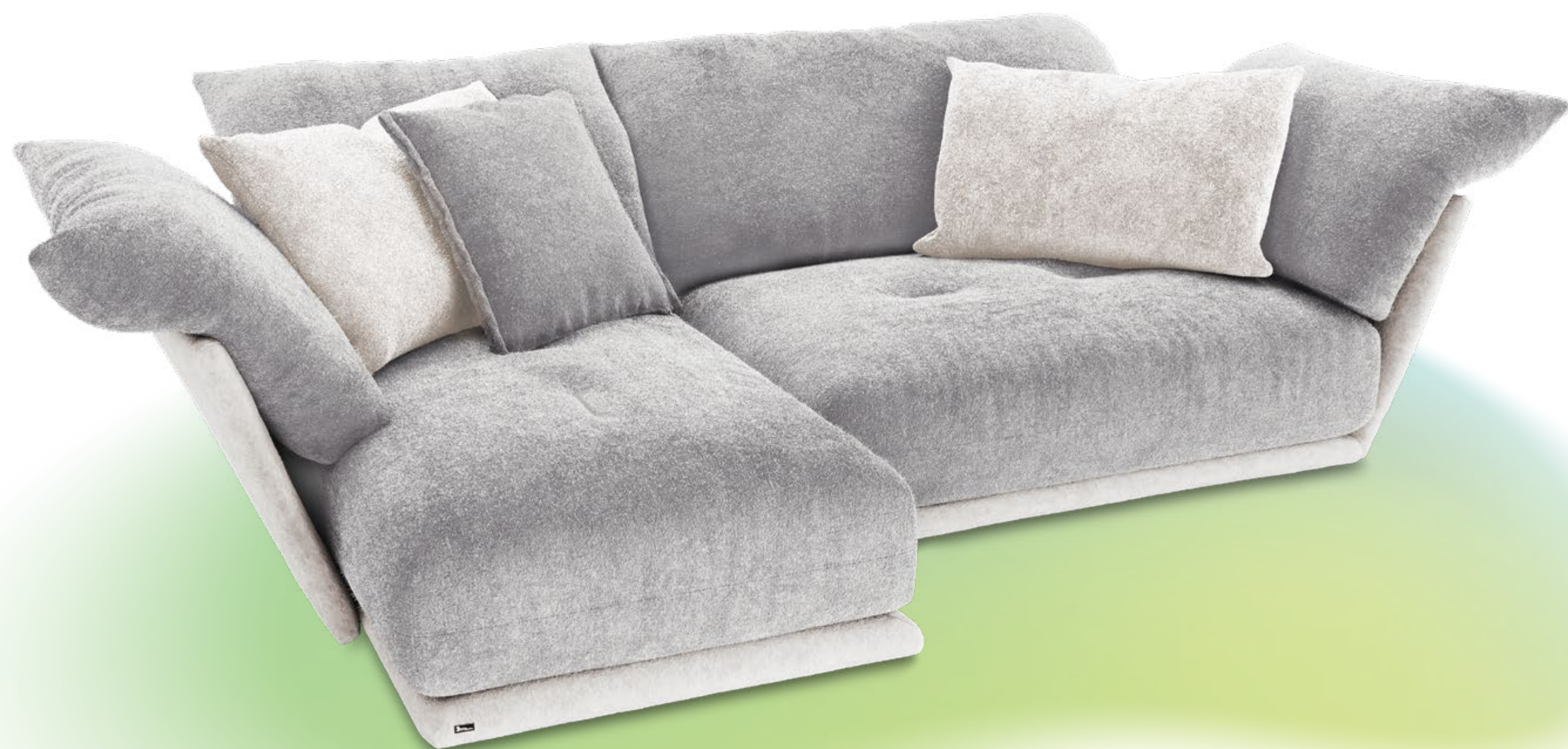
H 102li Esfera (Set 2) BxTxH 292 x 168 x 81 cm Farbic: moonlight / grigio