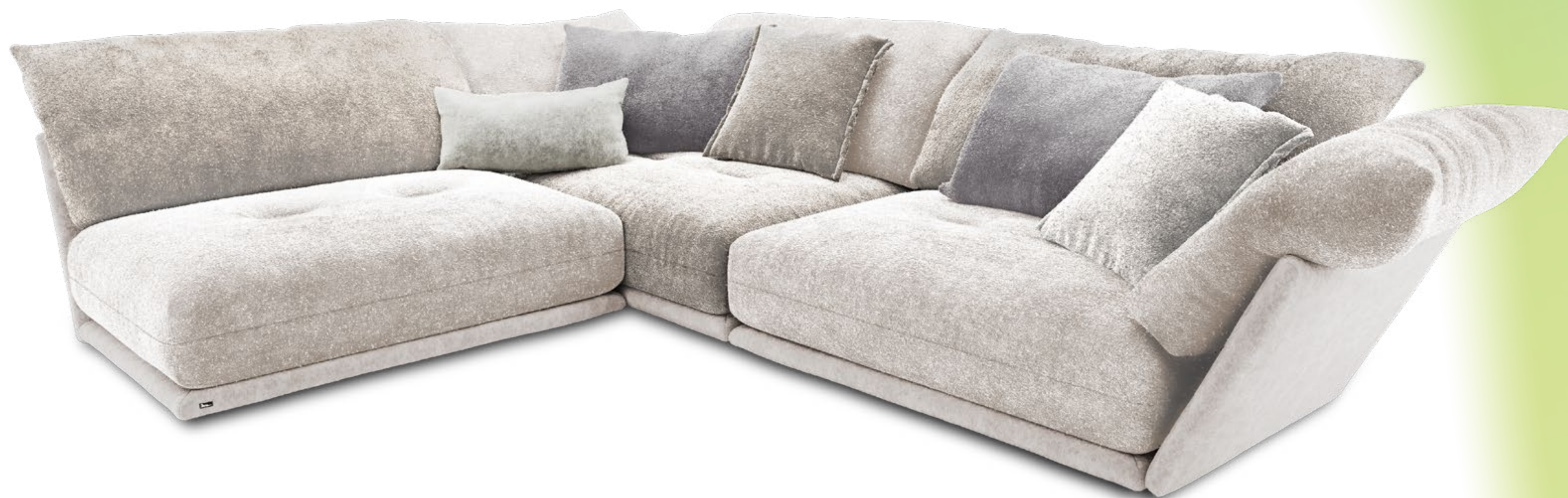
Z 102 li Esfera (Set 3) BxTxH 336 x 256 x 81 cm Fabric: moonlight / nuvola / lino