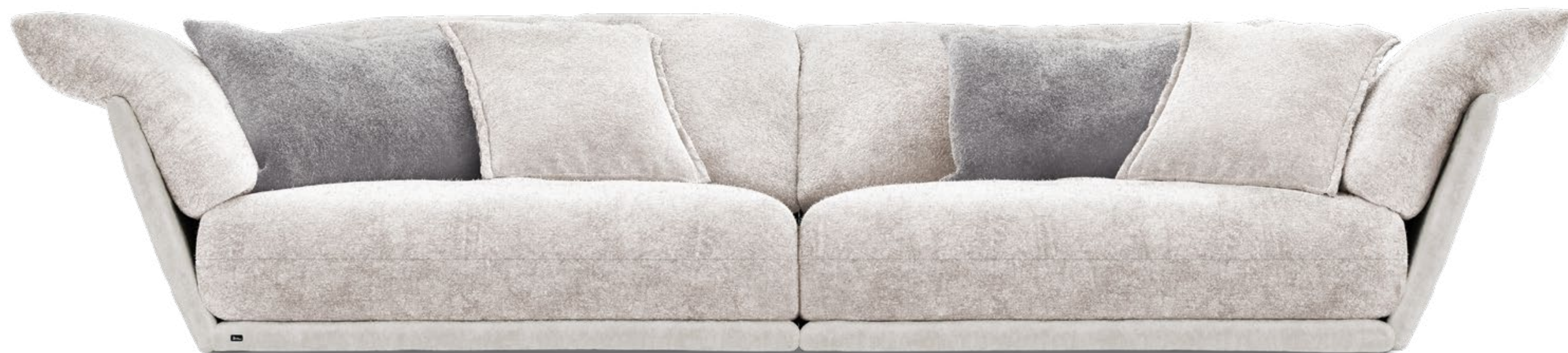
G 102 Esfera (Set 1) BxTxH 336 x 124 x 81 cm Fabric: moonlight / nuvola