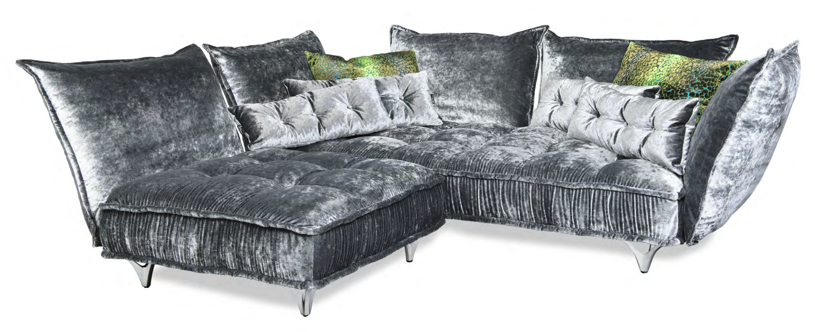
OHLINDA F 118-2 x L 118 R-2 x L 118N