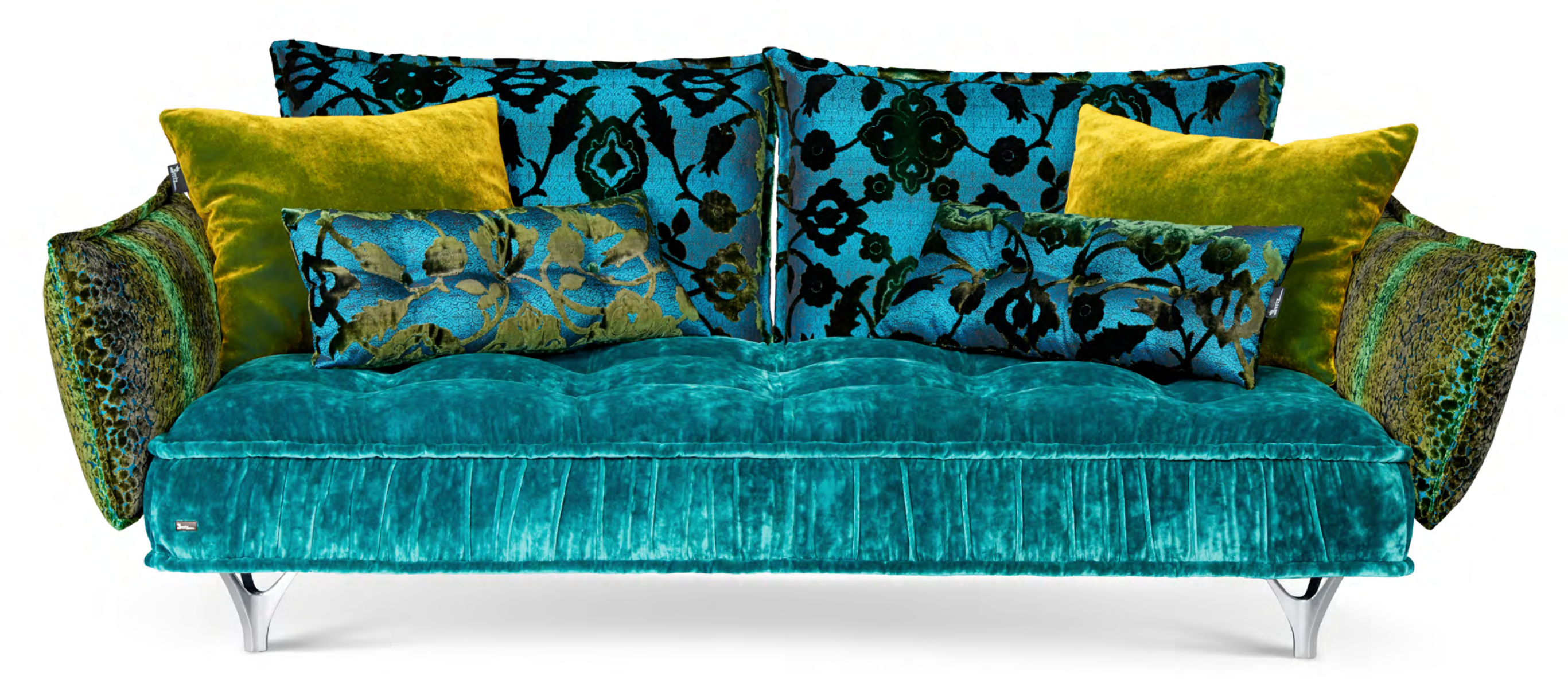
OHLINDA F 118-2 x L 118 R-2 x L 118N