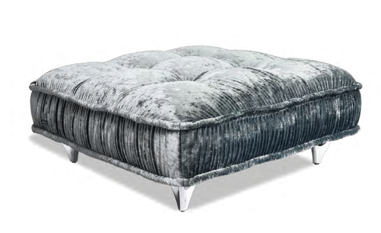
OHLINDA E 118 S

➤ 92 CM ¶ 92 CM 40 CM STOFF • FABRIC • TISSU 66 2085