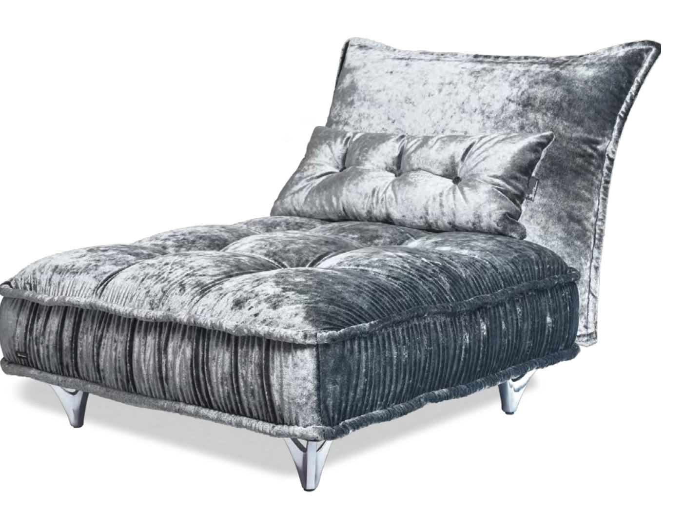
OHLINDA CHAIR E 118S-L 118R-L 118

➤ 92 CM ¶ 92 CM 40 CM STOFF • FABRIC • TISSU 66 2085