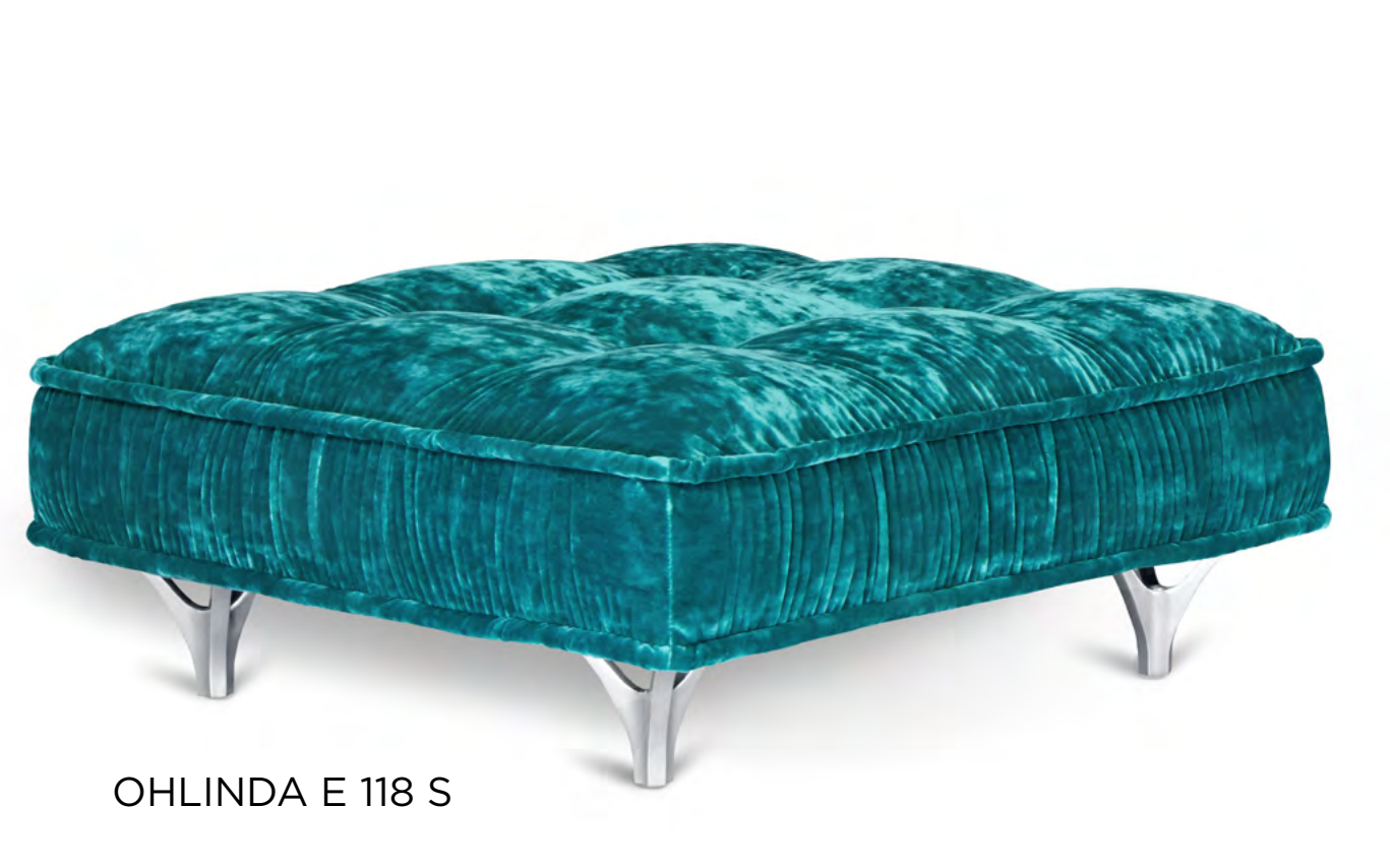
➤ 92 CM ¶ 92 CM 40 CM STOFF • FABRIC • TISSU 65 9632