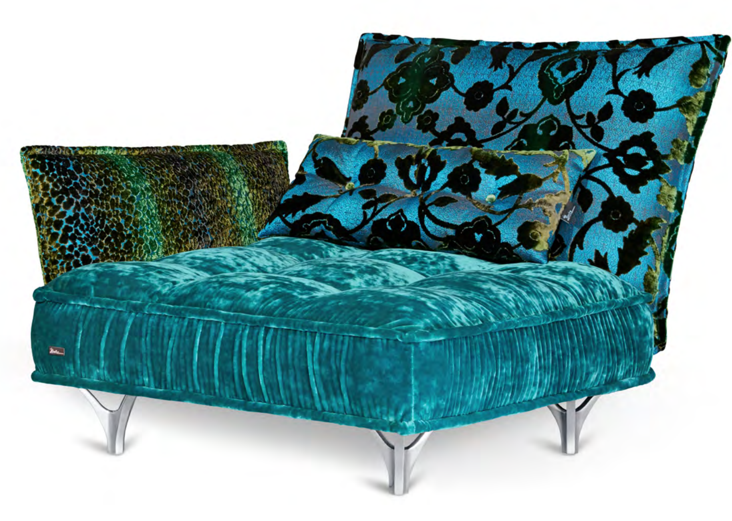
OHLINDA CHAIR E 118S-L 118R-L 118N