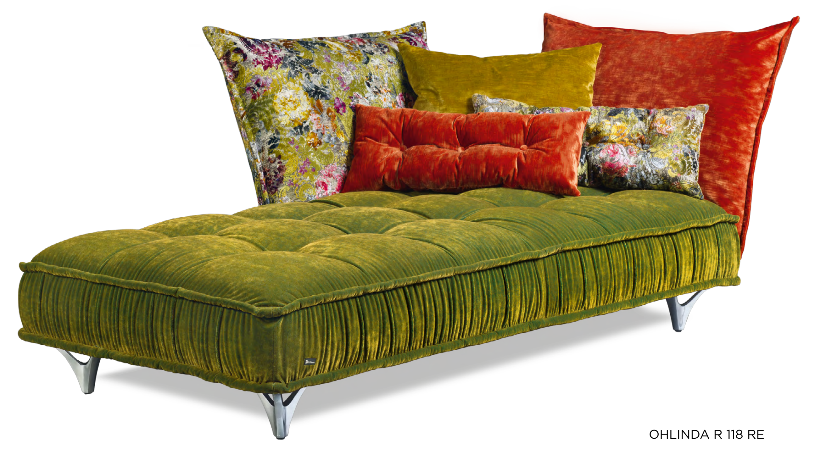
➤ 217 CM ▼125 CM ★88 CM STOFF • FABRIC • TISSU 66 8438 | 64 2975 | 64 2960 | 68 1035