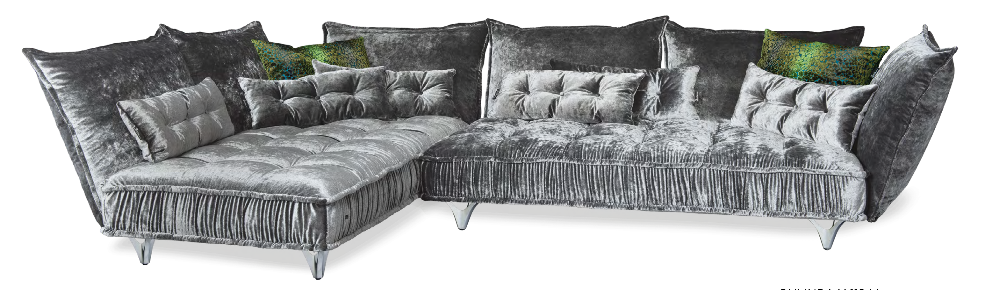
OHLINDA Y 118 LI ▶243 CM ◀217 CM ▲88 CM