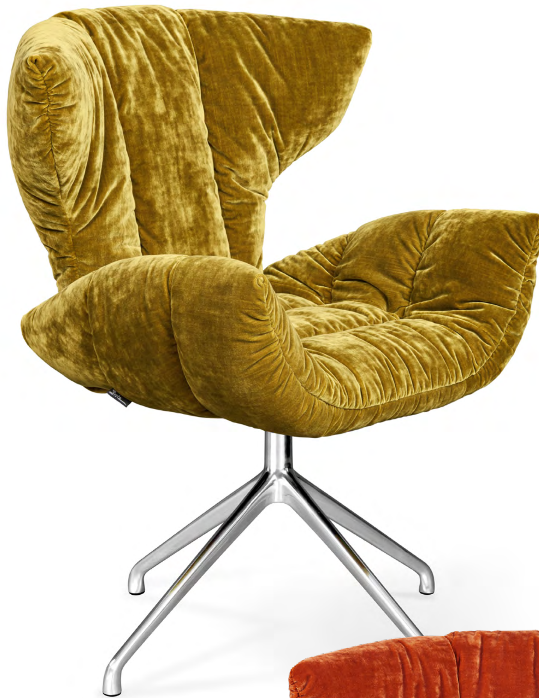
CASSIA CHAIR B156

➤ 67 CM ↗ 57 CM ▲ 87 CM STOFF • FABRIC • TISSU 641978