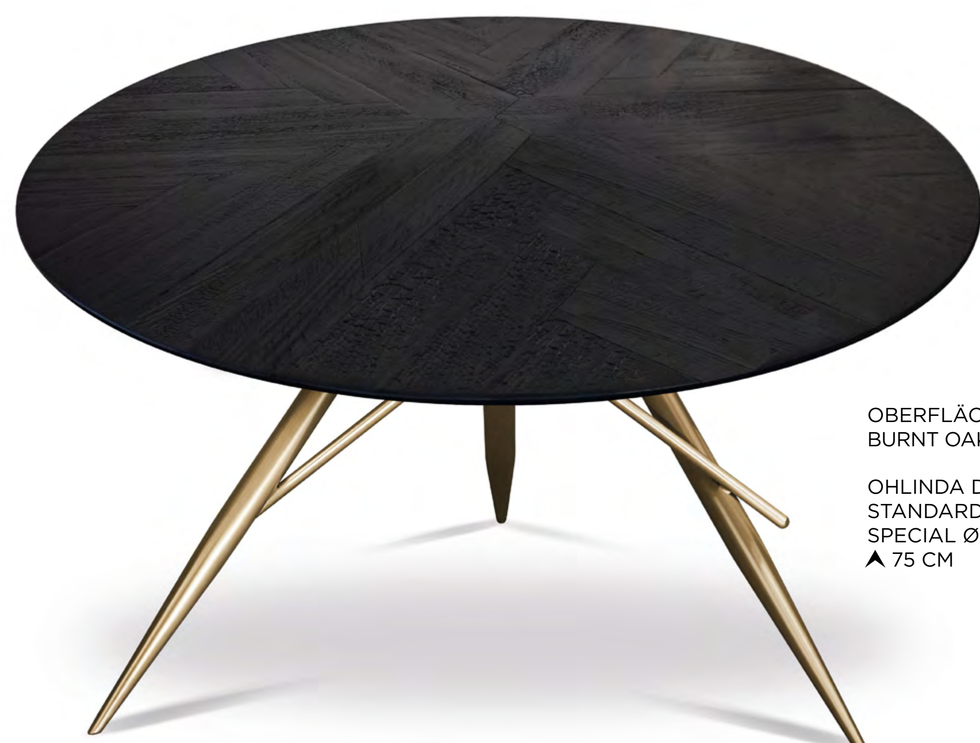
OBERFLÄCHE • SURFACE • SURFACE BURNT OAK

➤ 53 CM ➤ 68 CM ▲ 90 CM STOFF • FABRIC • TISSU 641978