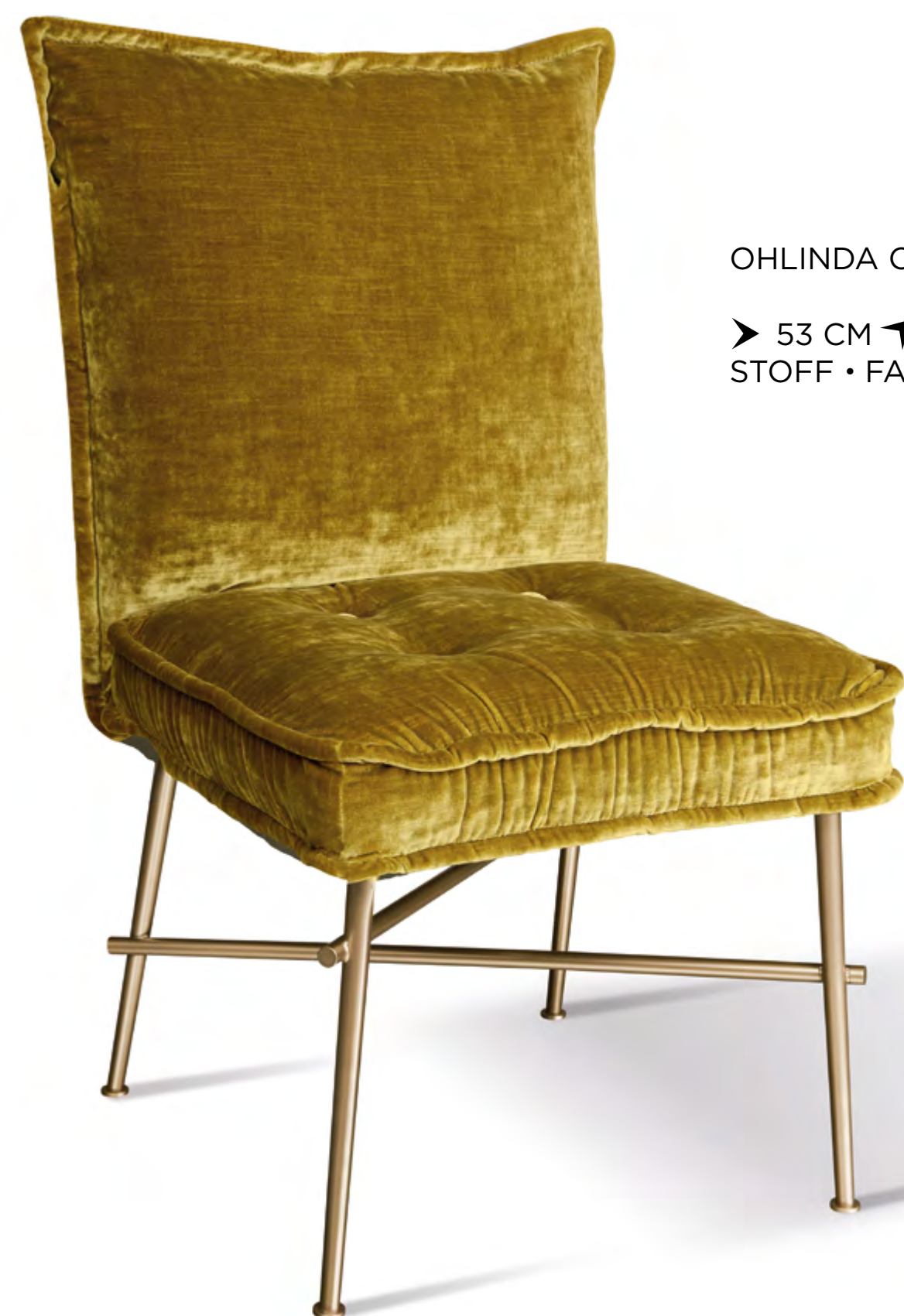
OHLINDA CHAIR A 118

➤ 53 CM ➤ 68 CM ▲ 90 CM STOFF • FABRIC • TISSU 641978