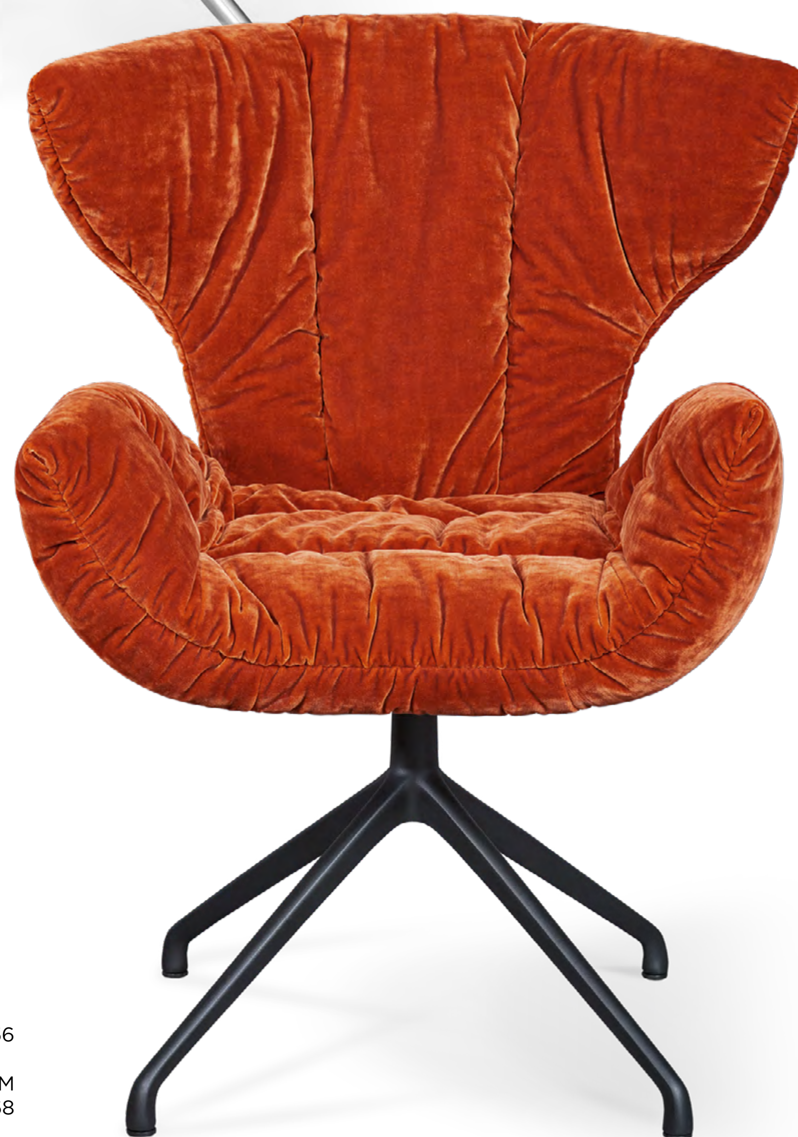
CASSIA CHAIR B156

➤ 67 CM ↗ 57 CM ▲ 87 CM STOFF • FABRIC • TISSU 641978